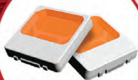
EzyLED™ PLCC w/IC

Since it first lit up the US market in 1995, American Bright Optoelectronics Corporation has enjoyed steady, consistent growth in multiple markets including General Lighting, Aircraft Interior Lighting, Gaming, Food & Beverage, Automotive, Horticulture Lighting, Signage, Industrial Automation, and Office Equipment. American Bright is a recognized leader in the lighting industry with global reach, engineering expertise and rapid customization solutions.